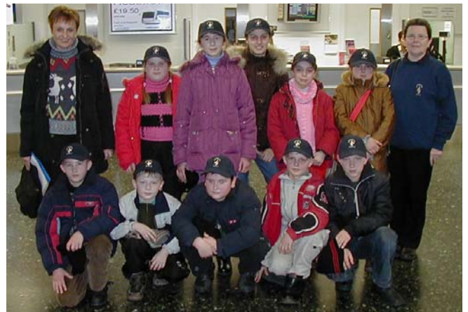
Children from Borodyanka hosted by Haslemere Link arriving at Gatwick on 25 February 2009