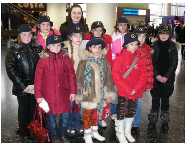
Children from Kyiv region hosted by Devizes Link arriving at Gatwick on 18 February 2009