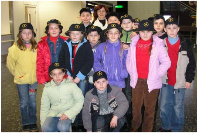
Children from Korosten hosted by Ayrshire Link arriving at Gatwick on 08 March 2009