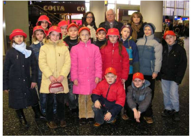
Children from Borodyanka hosted by Mansfield Link arriving at Gatwick on 22 February 2009