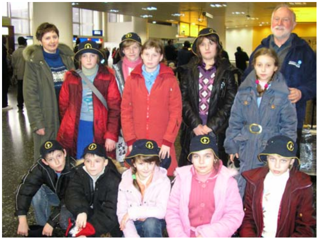
Children from Borodyanka hosted by Pembrokeshire Link arriving at Gatwick on 15 February 2009